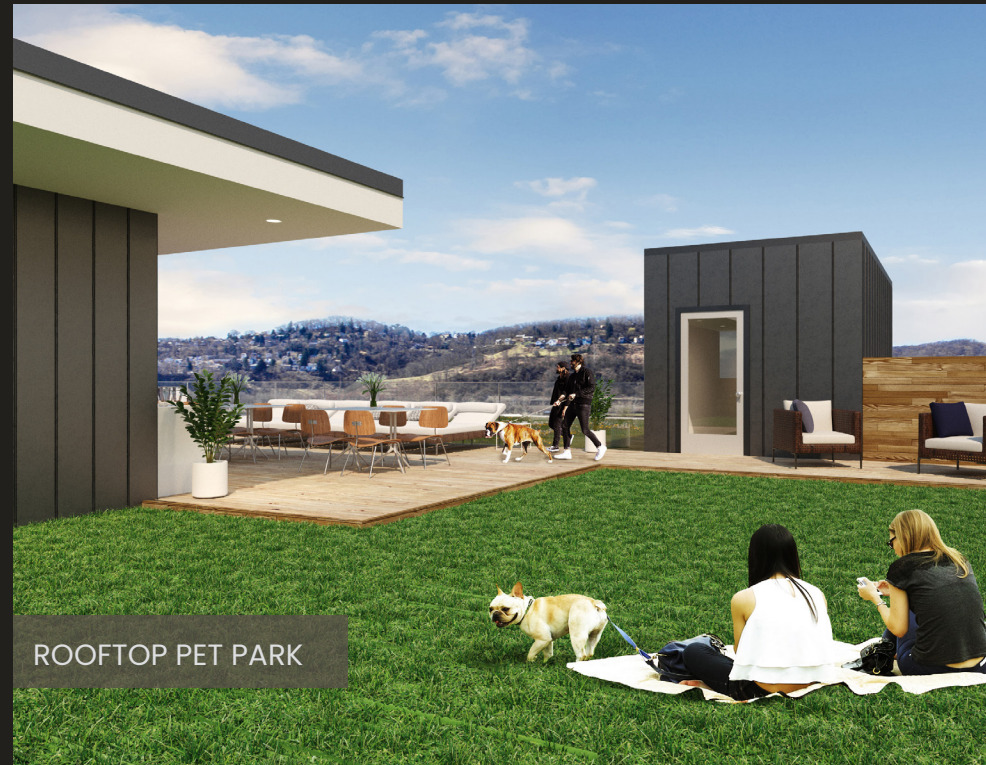
ROOFTOP PET PARK