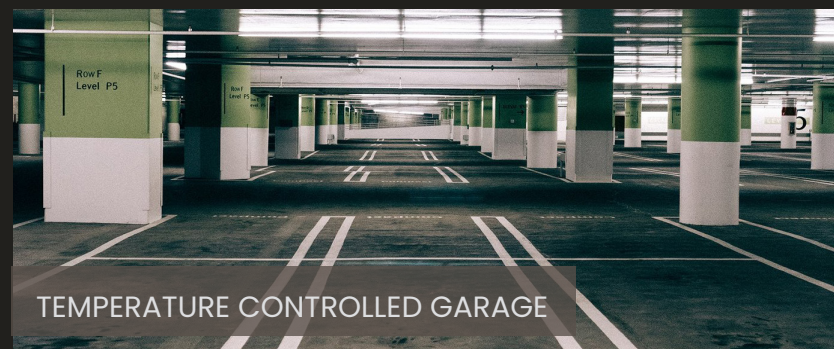
TEMPERATURE CONTROLLED GARAGE